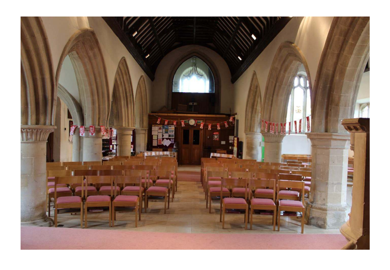
Figure 7: St Mary, Holmbury, nave looking east