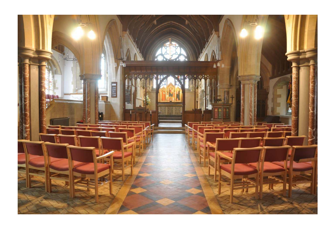
Figure 8: St Mary, Holmbury, nave looking west