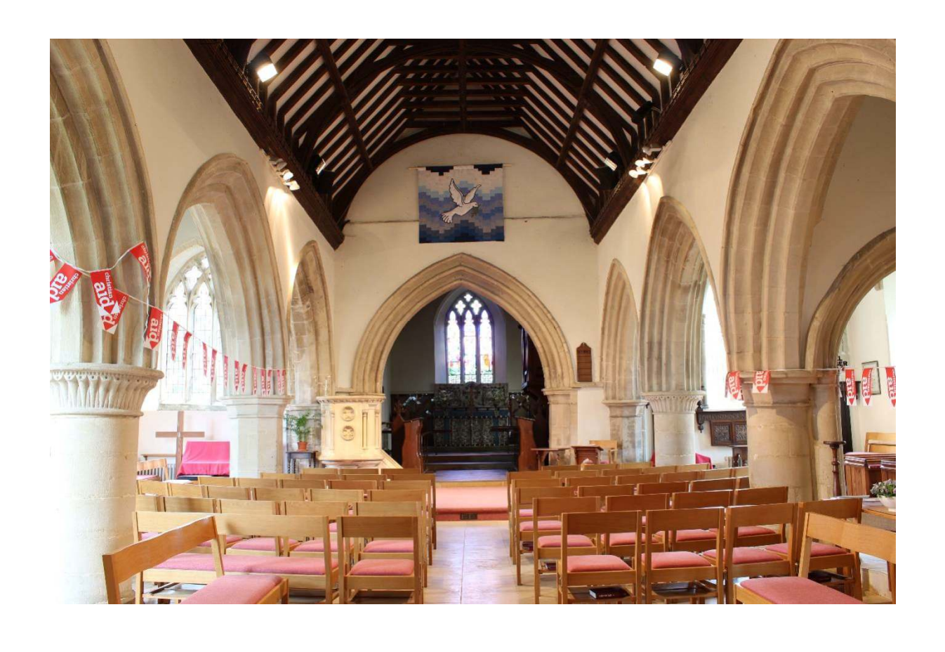
Figure 6: St Nicholas, Cuddington, nave looking west